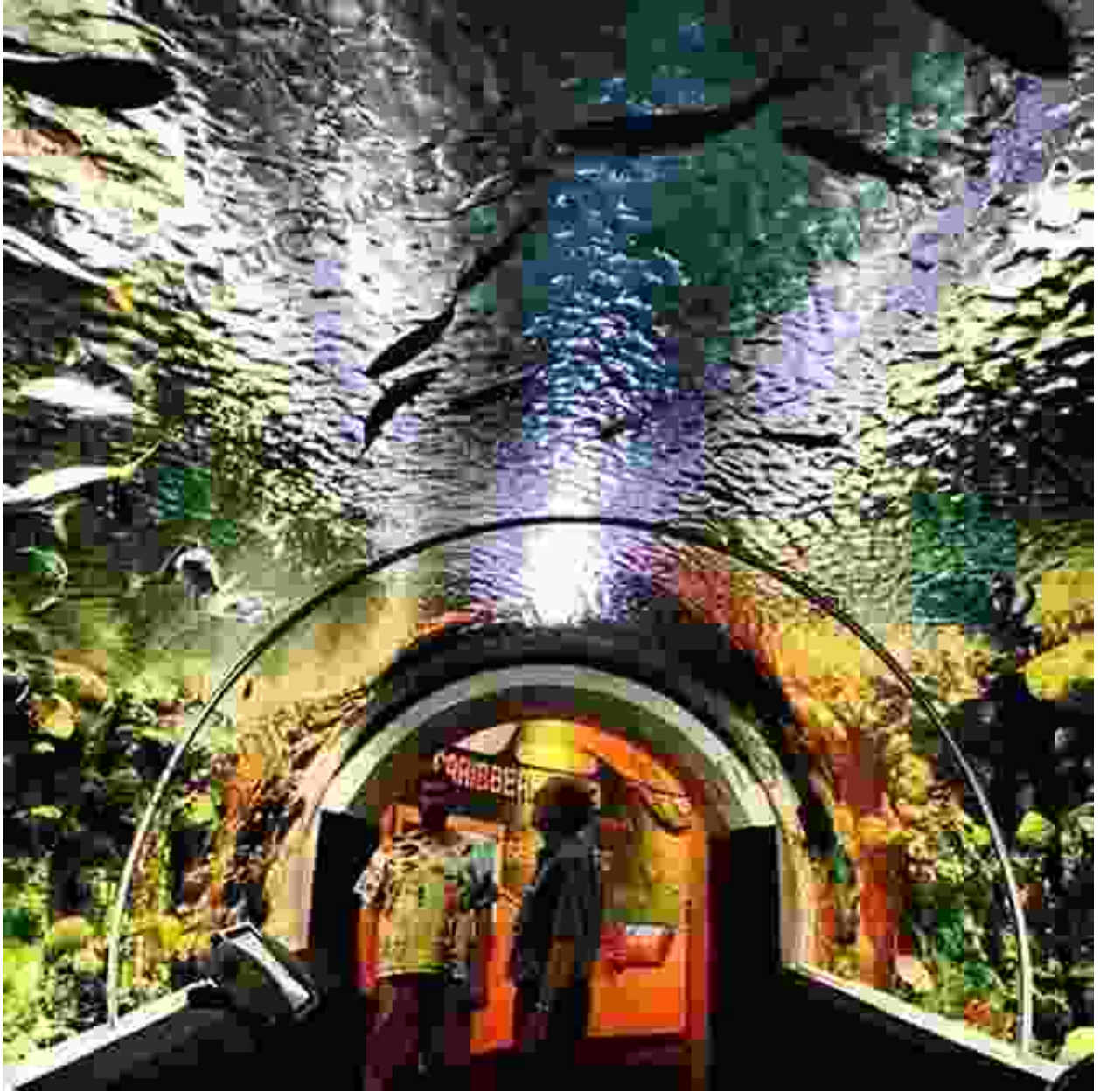
Hidden Gems for Families